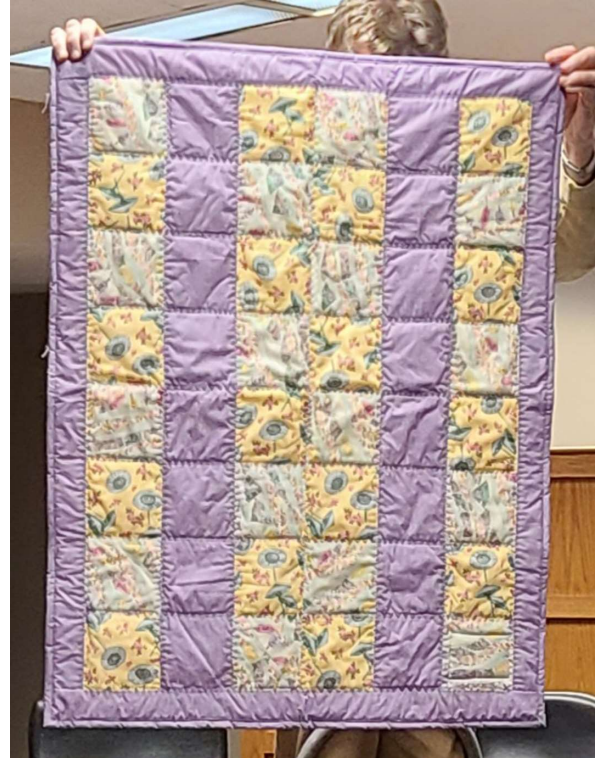
Shelbe Bullock 2.jpg