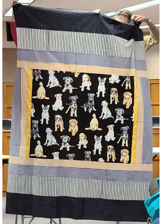
Delores Keaton 3.jpg