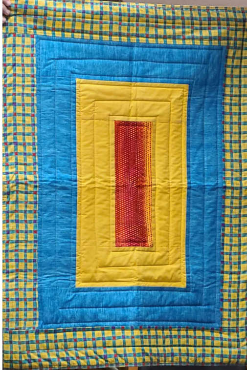
Shelbe Bullock 1.jpg