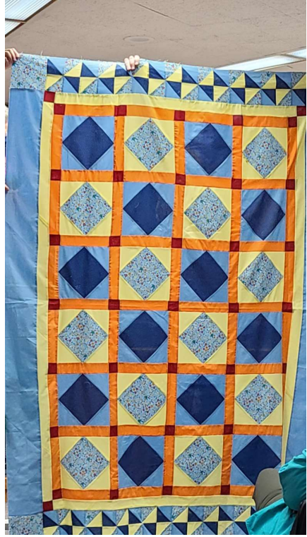
Delores Keaton 1.jpg