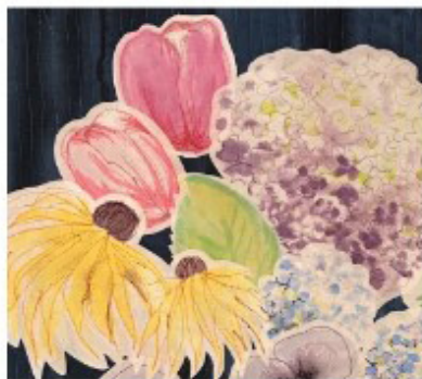
Hand painted flowers on fabric