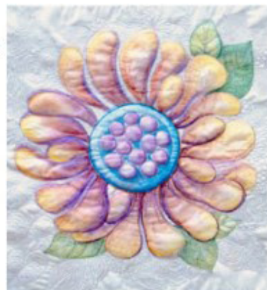
Hand-painted flower and machine quilting

In May, Candy Grisham will enlighten us with "What is Modern Quilting?"