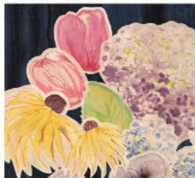
Hand painted flowers on fabric